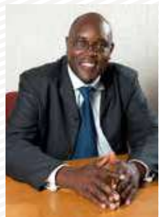
Godsave Nhekede Audit